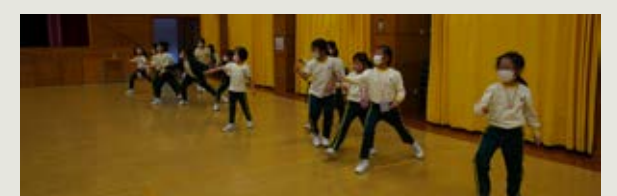
▲ Fencing practice is resumed at school.