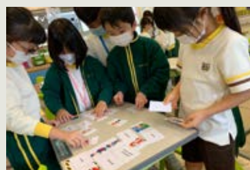
▲ Students enjoy working with classmates from different classes and grades in the PRP course!