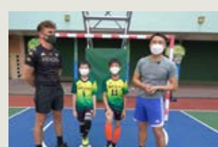
▲ Teachers and students team up in an exciting football shooting match!