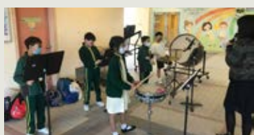
▲ Students devote their hearts and time in rehearsing for the School’s 20th Anniversary!

Our PRP session started on class resumption. Students from different classes and various school teams/ activities, including the 20th Anniversary music group, Emcees in Chinese and English, and Scrabbles, were shuffled to learn and work together. This served as a platform for students to extend their exposure and try out different roles and activities so that they can learn more about their strengths and interests.