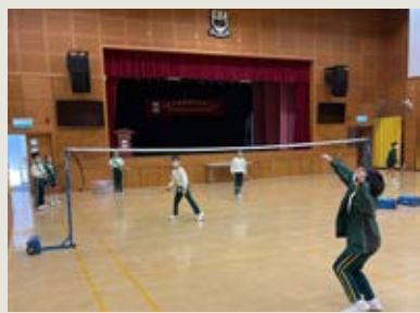
▲ Students enjoy playing badminton in the hall with friends.