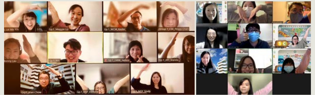
▲ Taking this photo via Zoom is actually more difficult than it looks!