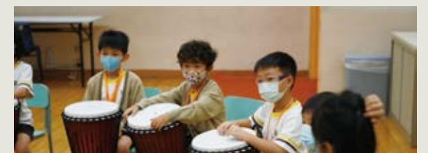
▲ Students experience playing African drums.