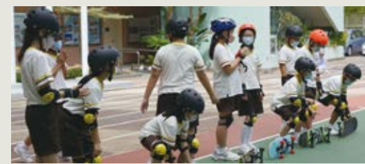
▲ The International Olympic Committee approves skateboarding to the sports programme for the Olympic Games Tokyo 2020.

The school has started arranging Multiple Intelligence (MI) Programme to our students on class resumption, allowing our students to attain whole-person development and to realise their potentials to the fullest. Skateboarding and archery are among our new MI lessons this academic year.