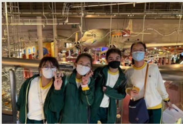
▲ Students from 6C tour around the Exhibition Hall.

Our P.6 students went on a field trip to the Hong Kong Science Museum in Term 1. The aims of the trip were to promote science, technology and astronomy amongst our students, and to raise their interests, curiosity and imagination through interactive exhibits. Getting outside of the classroom offered a great opportunity for our teachers and students alike the chance to explore a non-traditional method of teaching and learning (Morentin & Guisasola, 2015). The Hong Kong Science Museum presented an amazing opportunity for our students to engage in interactive exhibits, allowing them to explore the fun of science. The galleries covered a diverse range of scientific topics for students to explore, such as the electrifying Electricity and Magnetism Gallery, the ground-shaking Earth Science Gallery, the lively Biodiversity Gallery, amongst other fun and interactive activities and exhibits.