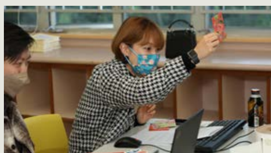
▲ Our teacher leads a lively Zoom experiential learning session on the topic of "Courtesy".