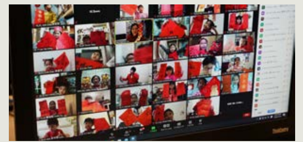
▲ Everyone creates a set of spring couplets at home and show them to their teacher.