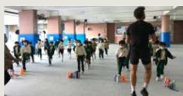
▲ Students have fun learning with different classmates and gaining new exposure!