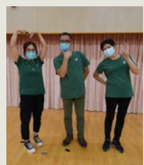
▲ Our school janitors lead a workout and sharing session in one of the Sportathon programmes.