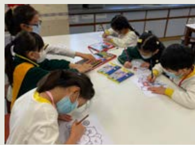
▲ Students are spending quality time with schoolmates during the colouring activity.