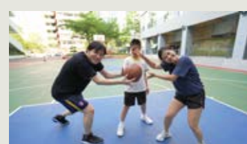
▲ Our teachers and students are having fun in a basketball match.