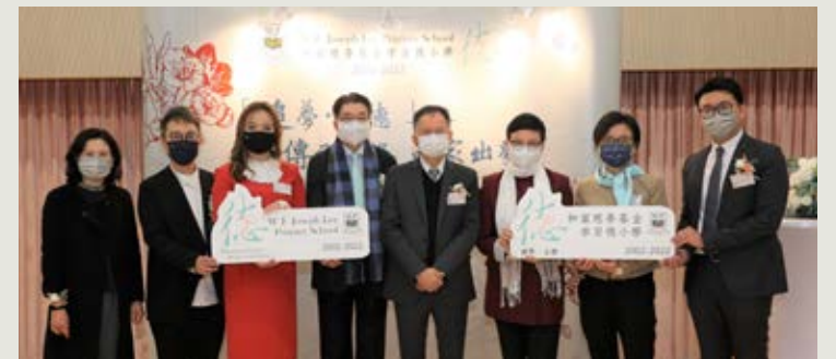
▲ We are honoured to have renowned guests as our speakers, where they share on how to nurture children with good moral character at home.

The event serves as a good starting point to nurture students and parents in the community to be good and do good for others, and that all of us are responsible and capable to build a harmonious and prosperous society. It resonates with the School's philosophy of "Harmony brings a family prosperity, cohesion makes a nation wealthy." Let's work hand in hand to plant the seeds of good values in our community and society.