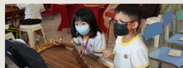
▲ Students concentrate in the Guzheng lesson.