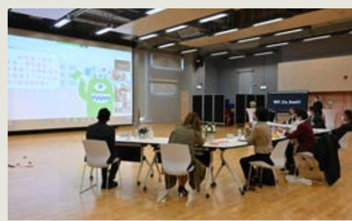
▲ Students have an interesting Zoom lesson to learn the "Five Confucian Constants".