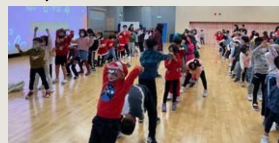
▲ Everyone enjoys the W F singing contest.