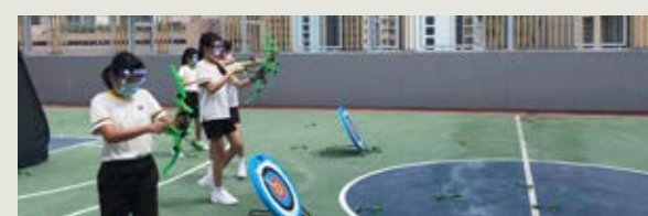
▲ Archery is easy to learn but difficult to master.

Students had fun learning new sports and enjoyed MI lessons so much. We will continue to review our MI lessons and look for new ways to create a fruitful life-wide learning experience for our students.