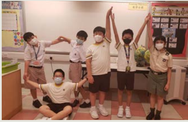
▲ Members of the OM team take a photo together.

Odyssey of the Mind Competition is the largest creative problem-solving competition in the world for children. It requires students to work together as a team to design a solution to a long term problem. This year, our team created an 8-minute musical play about the historical figure Phineas Gage. It was a very special year for us as we could not get together due to the pandemic. However, we did not limit ourselves but showed our creativity by completing the filming of the whole play on Zoom. We also managed to work individually in making the props and costumes. We helped each other by sharing ideas on the designs and how to make them through Zoom discussions. At first it seemed impossible for the play to happen as we had to write our own script and lyrics, and make our own props and costumes. However, we were able to finish it at last with the help of our teachers and teammates in addition to endless practices. We even came in first place in the HK region. It was such an unforgettable experience for all our teammates!