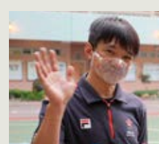
▲ Renowned Hong Kong cyclist Mr. Wong Kam Po sheds light on what it means to be perseverant.

To celebrate its 20th Anniversary, the School kicked off its third major celebratory event Sportathon in May themed under "Be a Warrior". Through this event, we hope our students can make exercise a daily habit to maintain both physical and mental health, as well as to build the good virtue of perseverance that we can experience from doing sports.