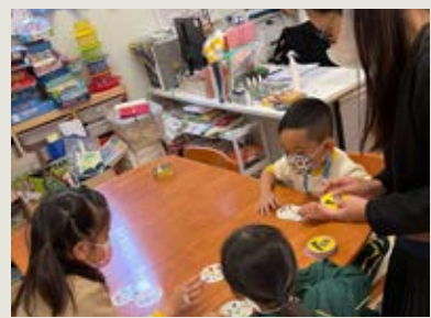
▲ Students enhance their social skills through playing board games under the guidance of the school social worker.

Recess is good for students’ physical and mental health meanwhile fulfilling their social needs, and most important of all, it is fun! Students made the best use of recess to do various kinds of activities with their friends and teachers. Students were also selected to be recess ambassadors to maintain the order during recess. All of them demonstrated excellent self-discipline under the “new normal”. It is good to see students having fun in recess again. Let’s be safe and enjoy to the fullest!