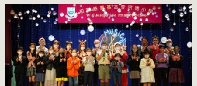
▲ Students are excited to participate in the inter-class competition.