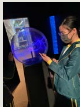
▲ A student plays with an exhibit in the Electricity and Magnetism Gallery.