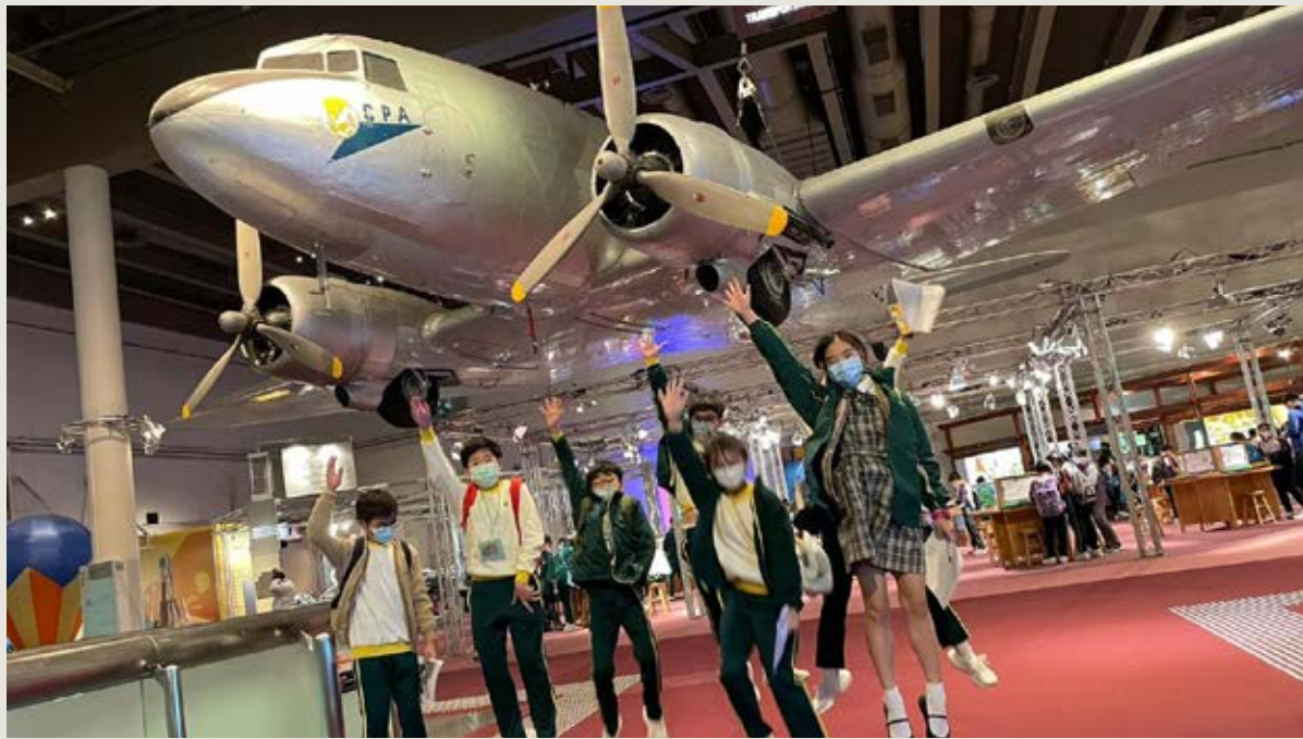
▲ A group of P.6 students are enjoying the Transportation exhibit.